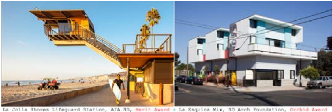
La Jolla Shores Lifeguard Station, AIA SD, Merit Award + La Esquina Mix, SD Arch Foundation, Orchid Award